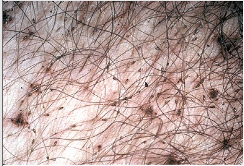
Pediculosis pubis Numerous lice and nits located around the pubic hair.