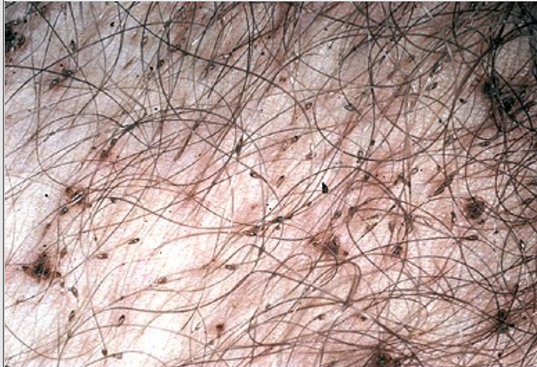
Pediculosis pubis Numerous lice and nits located around the pubic hair.